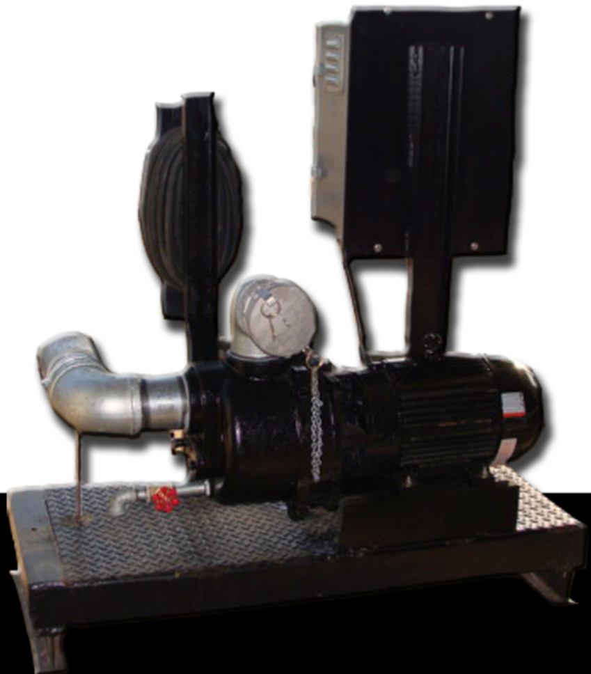
Aspen Sludge/Filtrate Pump Performance Curve

Breaker 15 HP VFD Inverter Duty Motor Water-tight Control Panel 50 Ft. SO Power Cord Metal Skid w/ Feet (for easy lifting) Cold Water Drain 4" Caps with Chains (during transport)